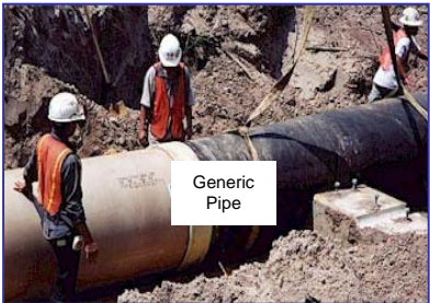
A total of 64,050 linear feet of various sizes of force main will be upgraded in the project area.