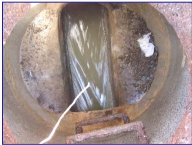
Flow measurements are taken throughout the collection system to determine the correct pump station upgrade size.

The purpose this project is to increase the capacity of the force main system in the North East Force main Basin to assist in transferring peak flows to the main STN sewer along Hooper Road and to increase the capacity of the gravity sewer systems upstream of PS155, PS195, PS200, and PS231. The gravity sewer replacement will work to alleviate chronic SSOs in the gravity basins upstream of these pump stations.